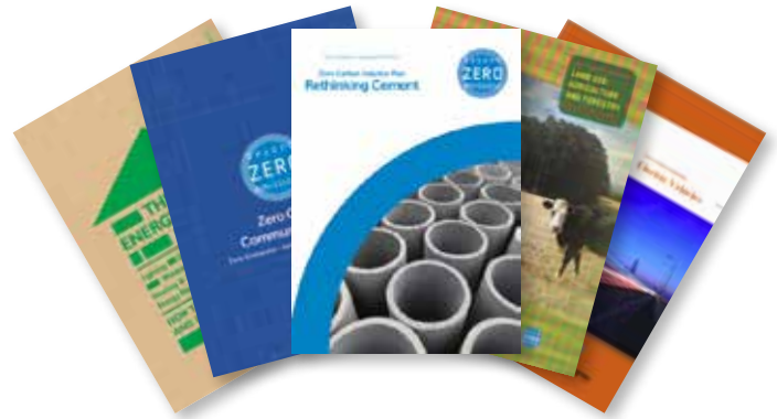
Figure 1: How Beyond Zero Emissions builds support for climate solutions

We mobilise the immense skills, experience and goodwill of our community to develop ground-breaking research, communicate it and influence others.