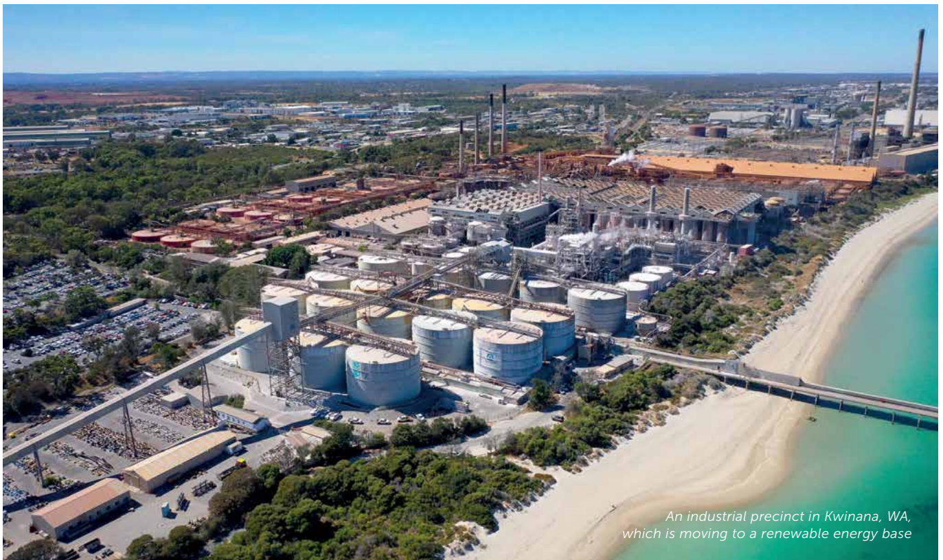
An industrial precinct in Kwinana, WA, which is moving to a renewable energy base

As Australia prepares for the COP31 international climate conference in 2026, we are committed to amplifying our knowledge-base and leveraging our networks to prioritise the interests of our region, particularly for the Pacific Islands facing the immediate impacts of climate change. With support, our targeted communication efforts will play a pivotal role in fostering wider public acceptance and understanding of these transformative technologies.